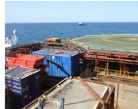
Water treatment container (blue) installed offshore on Transocean Arctic