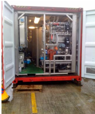
Container fitted with process equipment